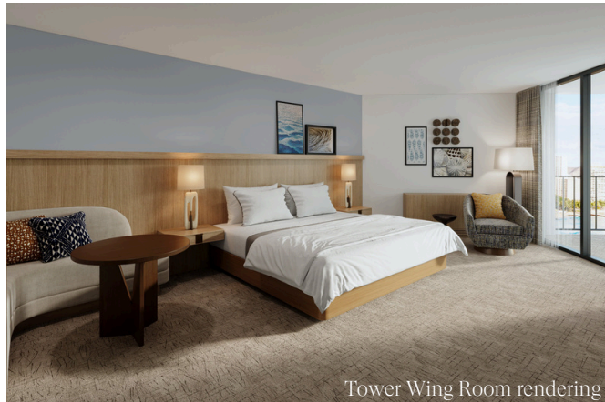
Tower Wing Room rendering