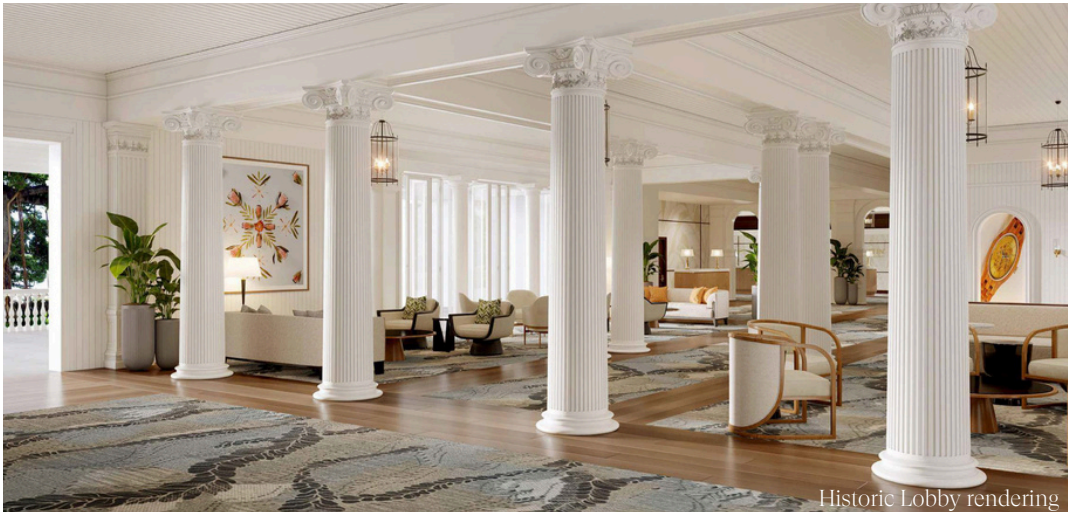
Historic Lobby rendering