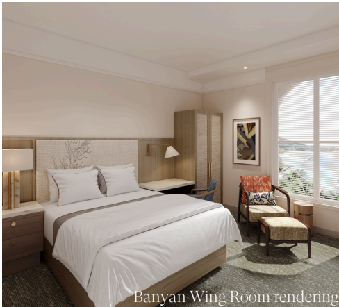
Banyan Wing Room rendering