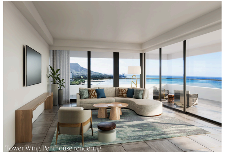
Tower Wing Penthouse rendering