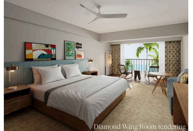
Diamond Wing Room rendering