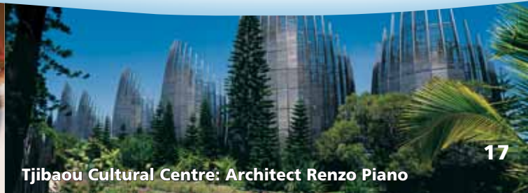
Tjibaou Cultural Centre: Architect Renzo Piano