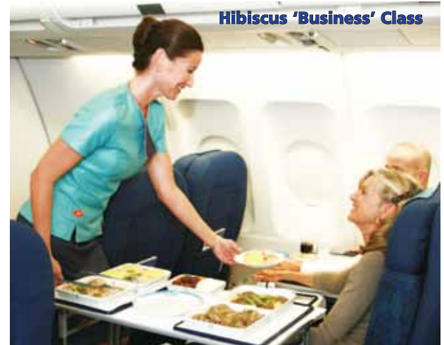
Hibiscus 'Business' Class

Our cabin service managers and flight attendants will do the utmost to ensure that your flight is smooth, comfortable, enjoyable and entertaining.