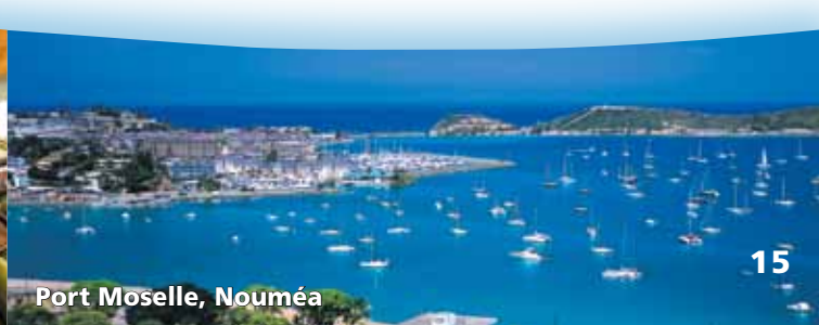
15 Port Moselle, Nouméa