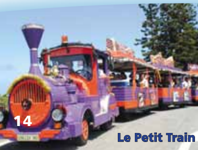
14 Le Petit Train