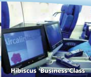
Hibiscus 'Business' Class