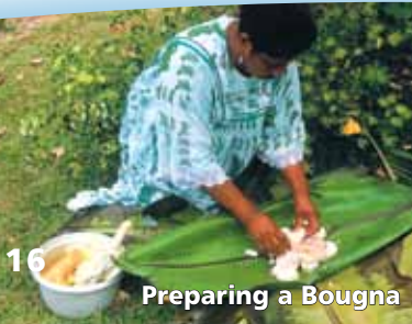
16 Preparing a Bougna

Chefs make a point of preparing quality cuisine using fresh lagoon and agricultural produce. You should also try mouth-watering Melanesian food such as a ‘Bougna’ – a combination of chicken, lobster or fish, with yams, bananas, sweet potatoes and coconut milk, wrapped in banana leaves and baked in the ground in a Kanak oven.