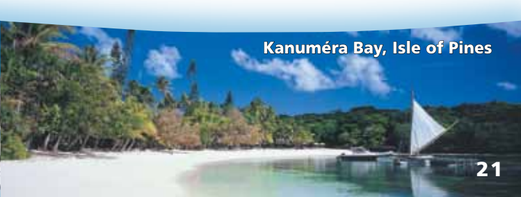
Kanuméra Bay, Isle of Pines